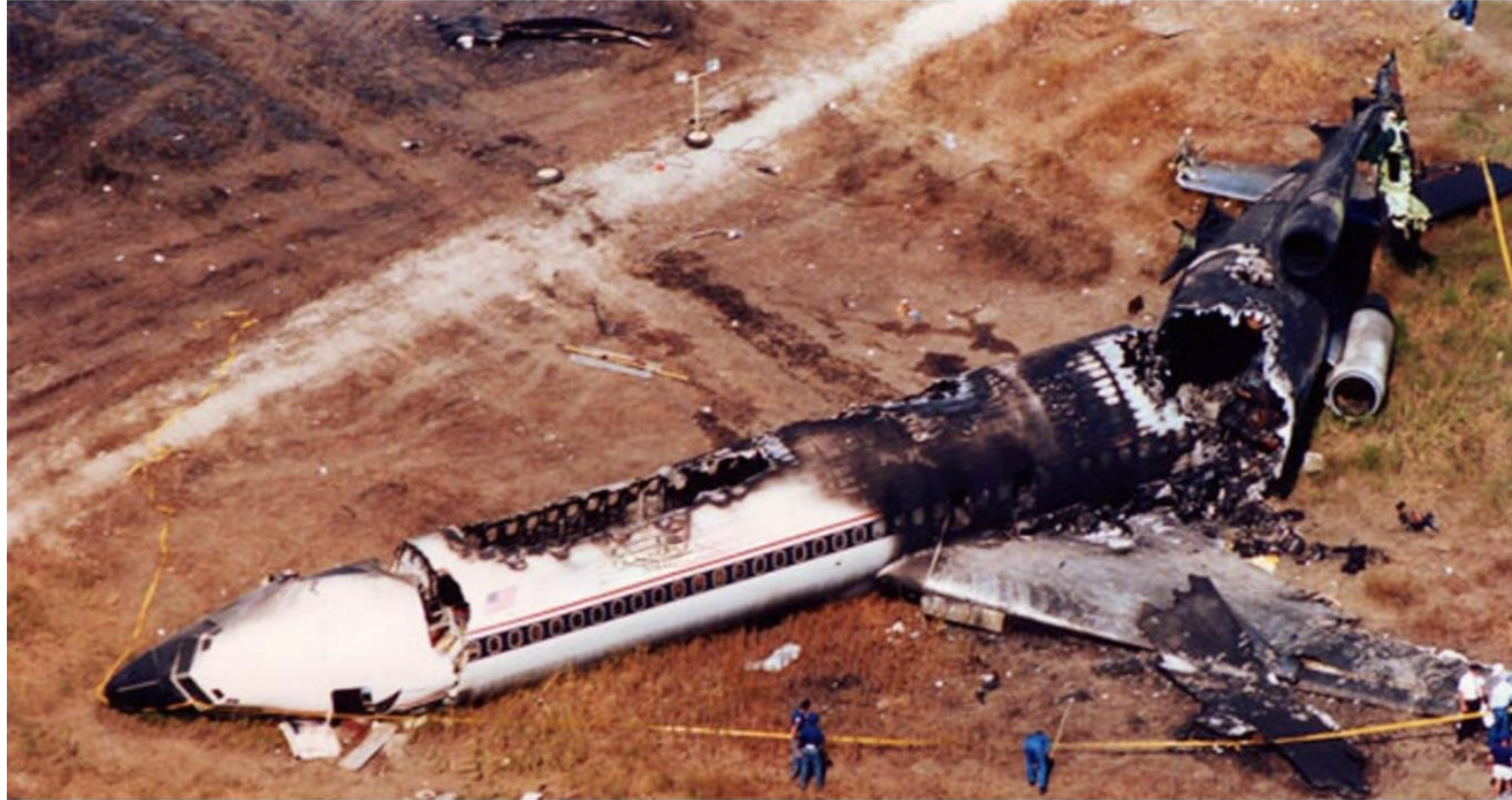
The wreckage of Flight 1141 after the crash.