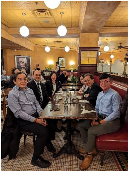
本學院訪團、法官學院訪團與曾大使、高組長於 Metropolitan Brasserie Restaurant 合影

本次 IOJT 會議為疫情近 3 年以後，本學院首次執行出國計畫，為求謹慎於行前聯繫駐加拿大代表處，詢問簽證、交通、行程等事項。於大會首日（10 月 31 日）議程結束後，駐加拿大代表曾厚仁大使邀請本學院代表團、法官學院代表團張升星院長、劉元斐組長於晚間餐敘。