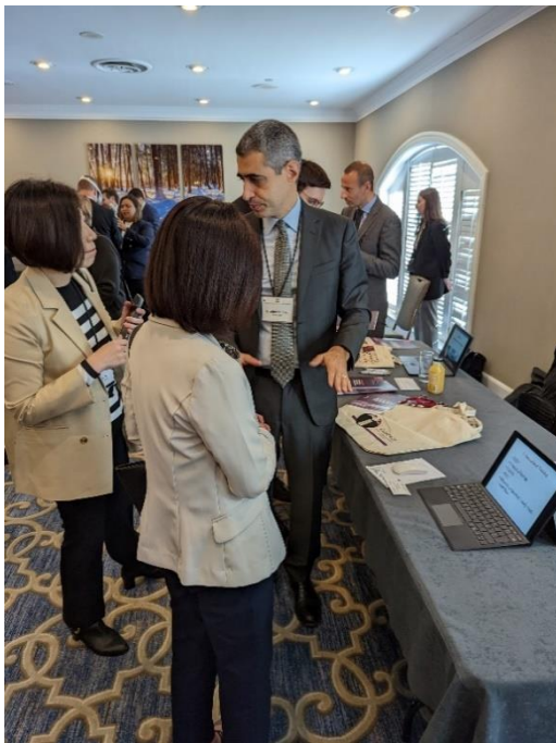
代表團聽取 Gianluca Grasso 法官簡介

主辦單位於議程中安排博覽會 (Knowledge and Networking Fair)，提供各代表團報名使用場地，簡介所屬機構、展示當前的司法教育計畫，以及讓各代表團有業務交流的機會。會場中 Gianluca Grasso 法官向代表團介紹義大利司法學院 (SSM, Scuola Superiore della Magistratura)，該學院制度與我國現制相仿，負責法官、檢察官的養成培訓及在職教育訓練。代表團詢問 Grasso 法官關於 SSM 的學習司法官是否有如同 ENM 的為期三週國際交流計畫，Grasso 法官回應 SSM 的學習司法官國際交流通常都是 2 至 3 天且只在歐洲進行，但若有機會也希望能讓學習司法官多至外國見習。