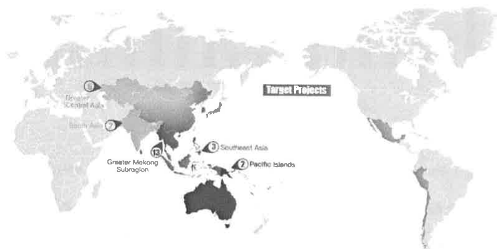
Fig. 3. Geographic distribution of APFNet projects 2016-2018

Geographically, projects were mainly centered in the Greater Mekong Sub-region (13 - 8 new, 5 on-going), followed by Great Central Asia (6 – 4 new, 2 on-going), Southeast Asia (except GMS) (3, 2 new, 1 on-going), South Asia (2 – 1 new, 1 on-going), and the Pacific Islands (2 – 1 new, 1 on-going). Two transboundary projects.