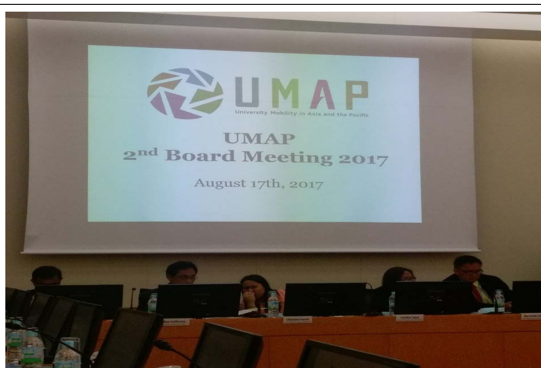
UMAP 2017 年第二次理事會開幕