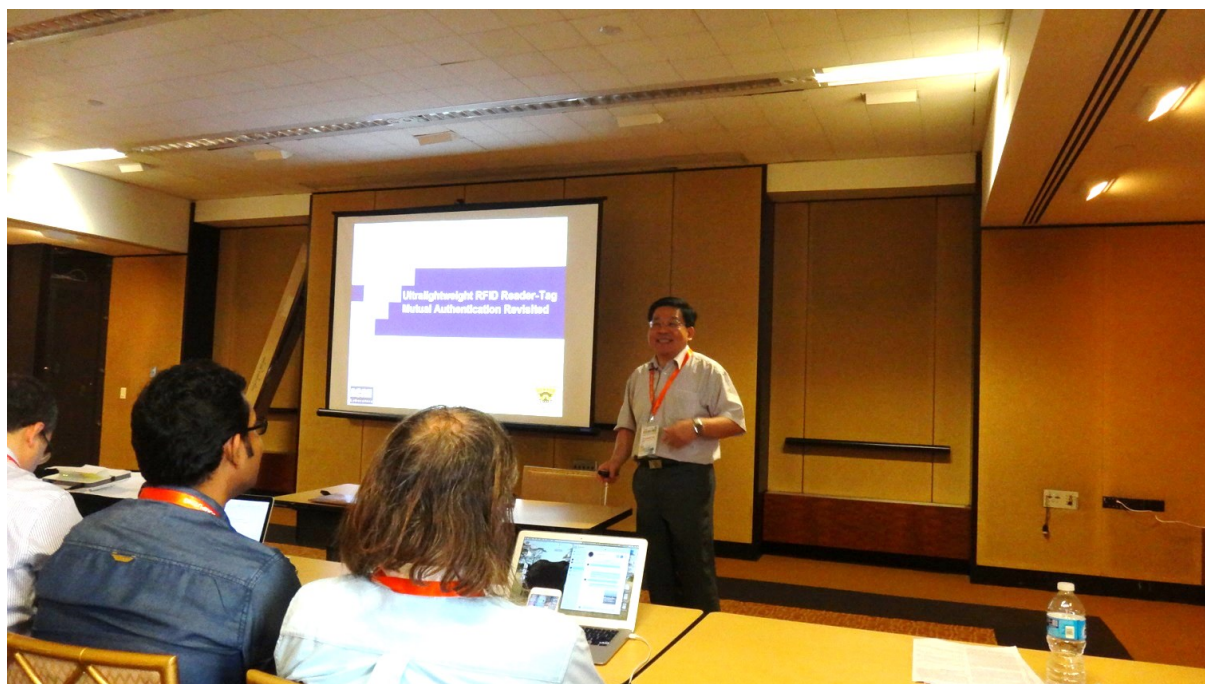
圖 2. 發表邀請論文的情形

本次發表之論文標題為 Ultralightweight RFID Reader-Tag Mutual Authentication Revisited，講述的是無線射頻辨識(RFID)標籤的安全性機制，有鑑於 RFID 技術是物聯網成功的關鍵之一，而其安全性更是此項技術全面使用不可或缺的項目，因此，此論文的發表吸引許多學者參加。圖 2 為論文發表的情形。