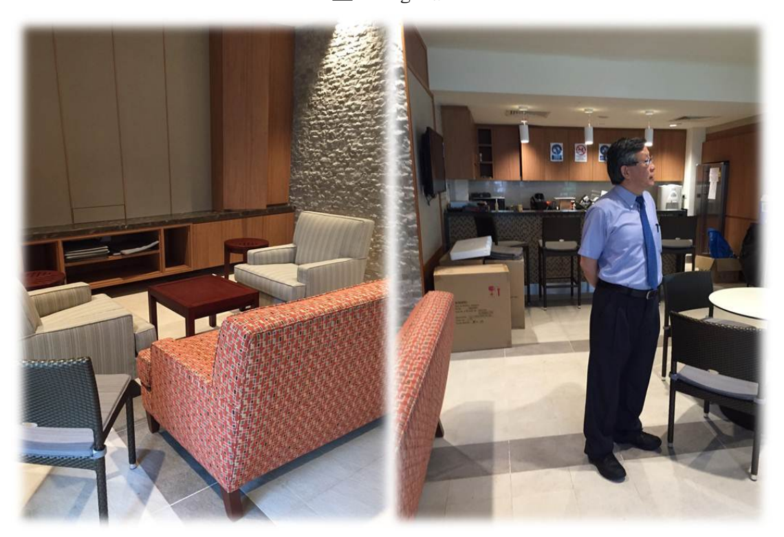
▲簡易廚房 Buttery 與 Buttery 沙發區