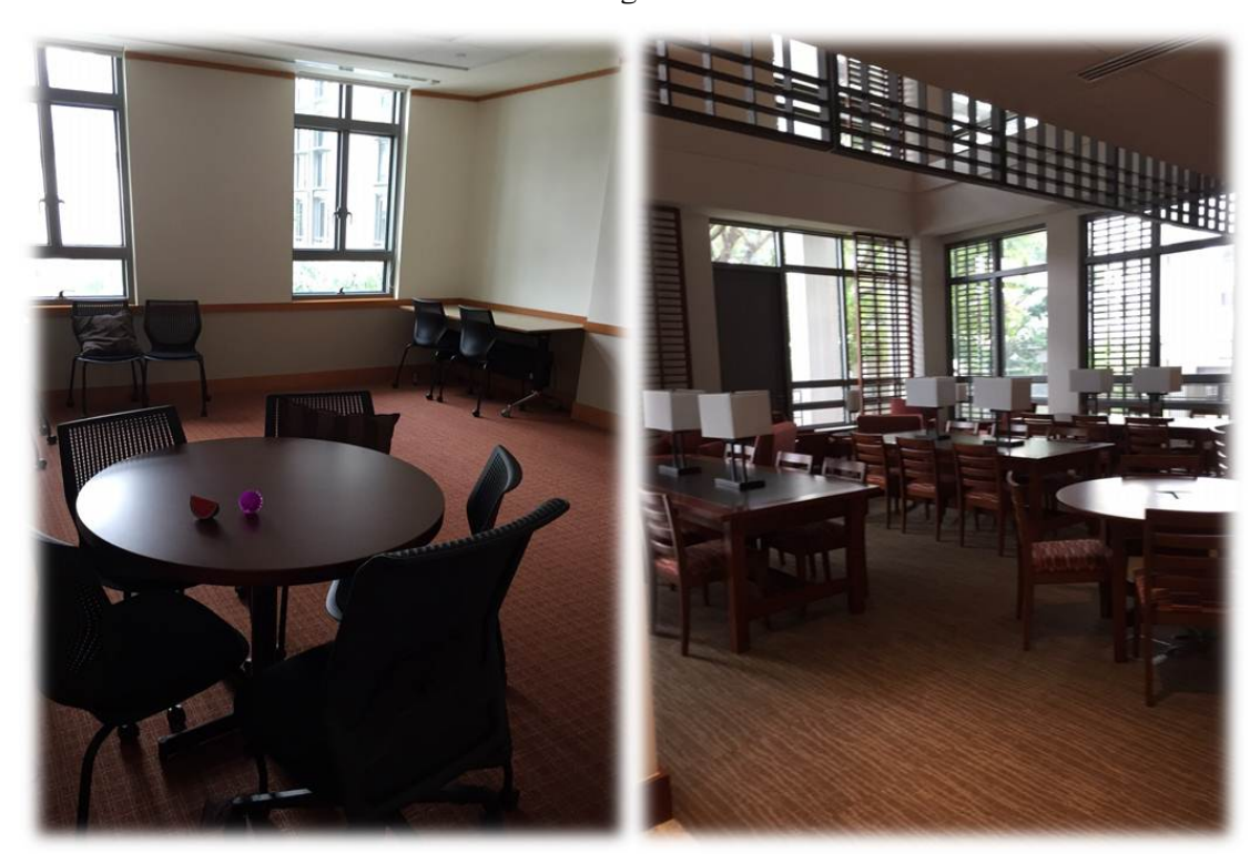
▲寫作輔導區與 Library Study Area