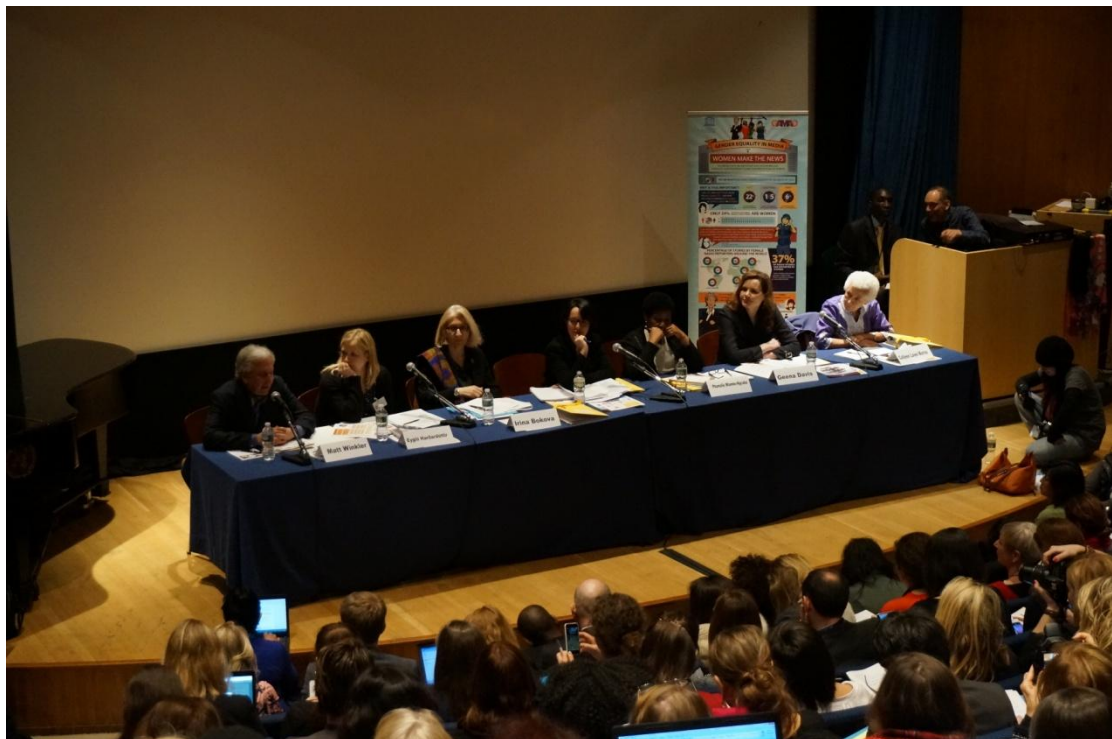
圖8：3月12日CSW周邊會議「女性與媒體」(Women and the Media: Advancing Critical Area of Concern J of the Beijing Platform for Action)。