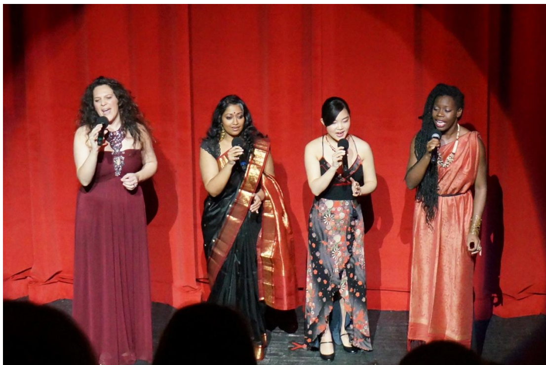
圖1：3月8日NGO諮商會前會開場表演，由來自墨西哥、丹麥、肯亞及中國的女性演唱「Women of the World」。