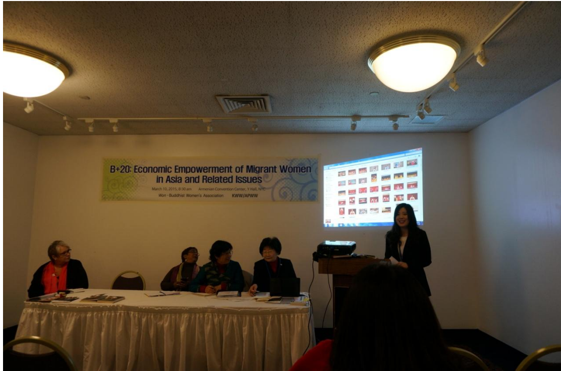
圖5：3月10日NGO-CSW平行會議，由南韓NGO主辦“Economic Empowerment of Migrant Women in Asia and Related Issues.”