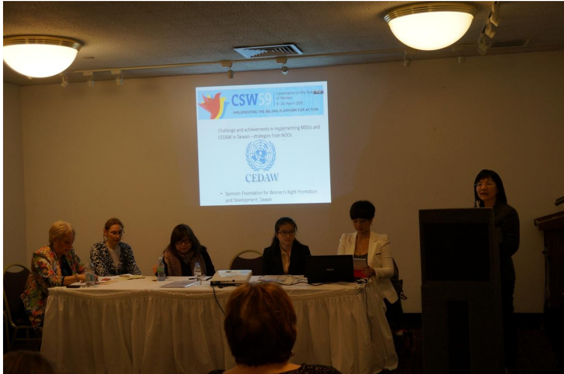
圖7：3月11日NGO-CSW平行會議，由我國婦權基金會主辦“Challenges and Achievements in Implementing MDGs & CEDAW in Taiwan.”