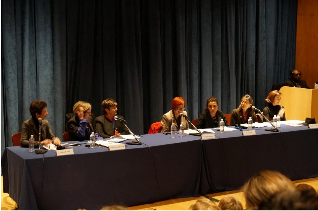
圖9：3月13日CSW周邊會議「議會中的性別平等」(The World Can't Afford to Wait Until the Next Century to Have Equal Participation in Parliaments)。