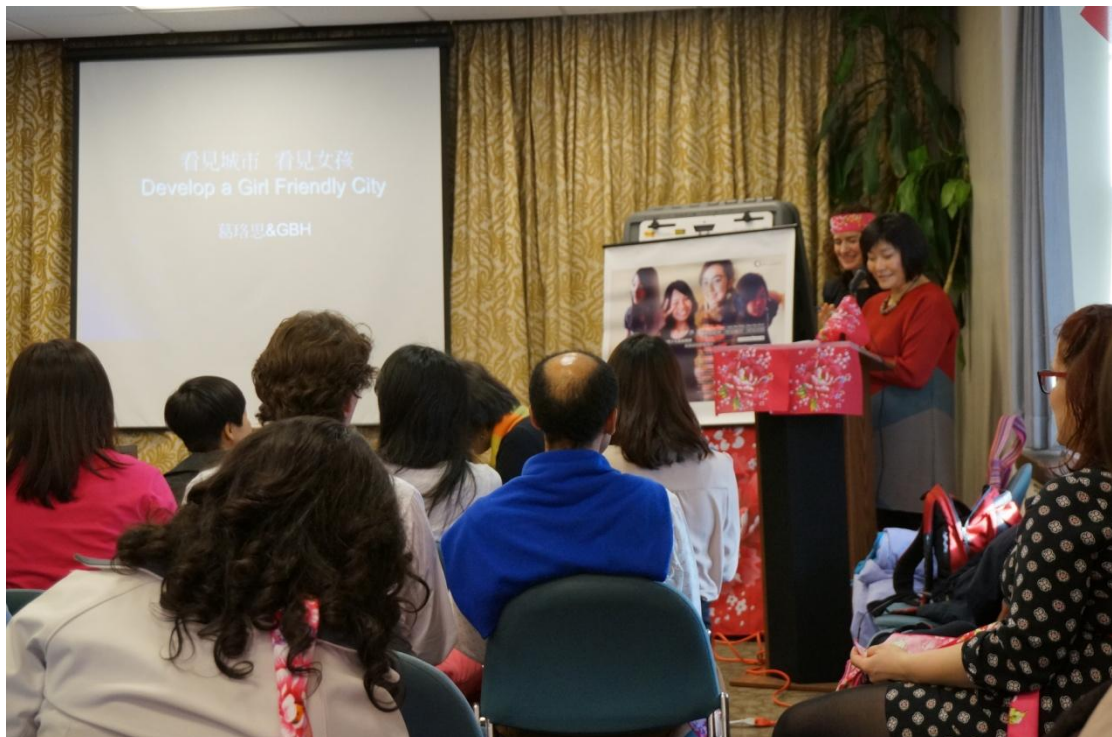
圖6：3月11日NGO-CSW平行會議，由我國勵馨基金會主辦“From CEDAW Cities to Girl Friendly Cities.”