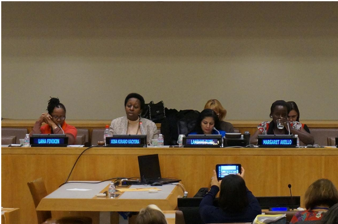
圖10：3月13日CSW周邊會議「公共空間：培力女性的機會與挑戰」(Public Space: Opportunities and Challenges for Empowering Women)