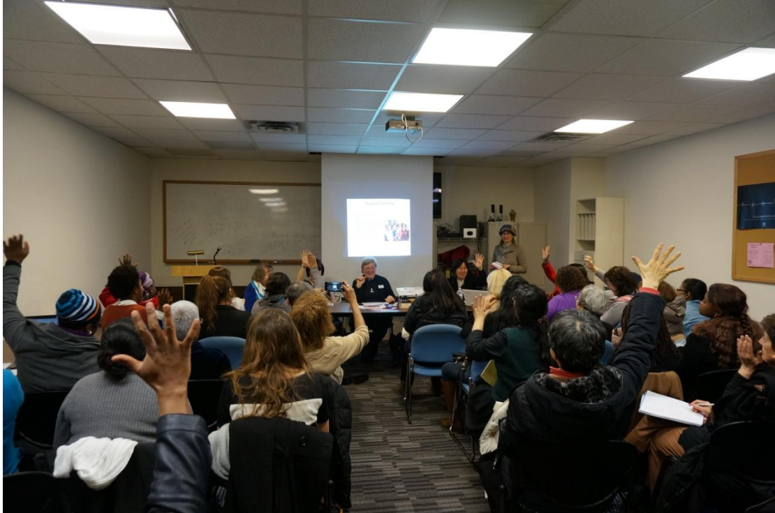
圖11：3月14日 NGO-CSW 平行會議，由我國中華心理衛生協會主辦 “New Paradigm of Gender Equality, Post-2015: Girls and Boys Go Together.”