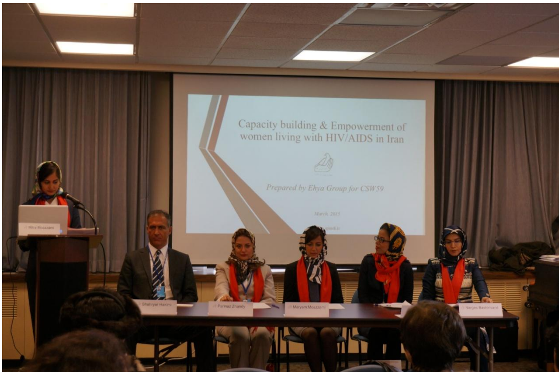
圖11：3月14日 NGO-CSW 平行會議，由伊朗民間團體主辦 “Empowering Women with HIV/AIDS and Endorsing Gender Equality in Iran.”