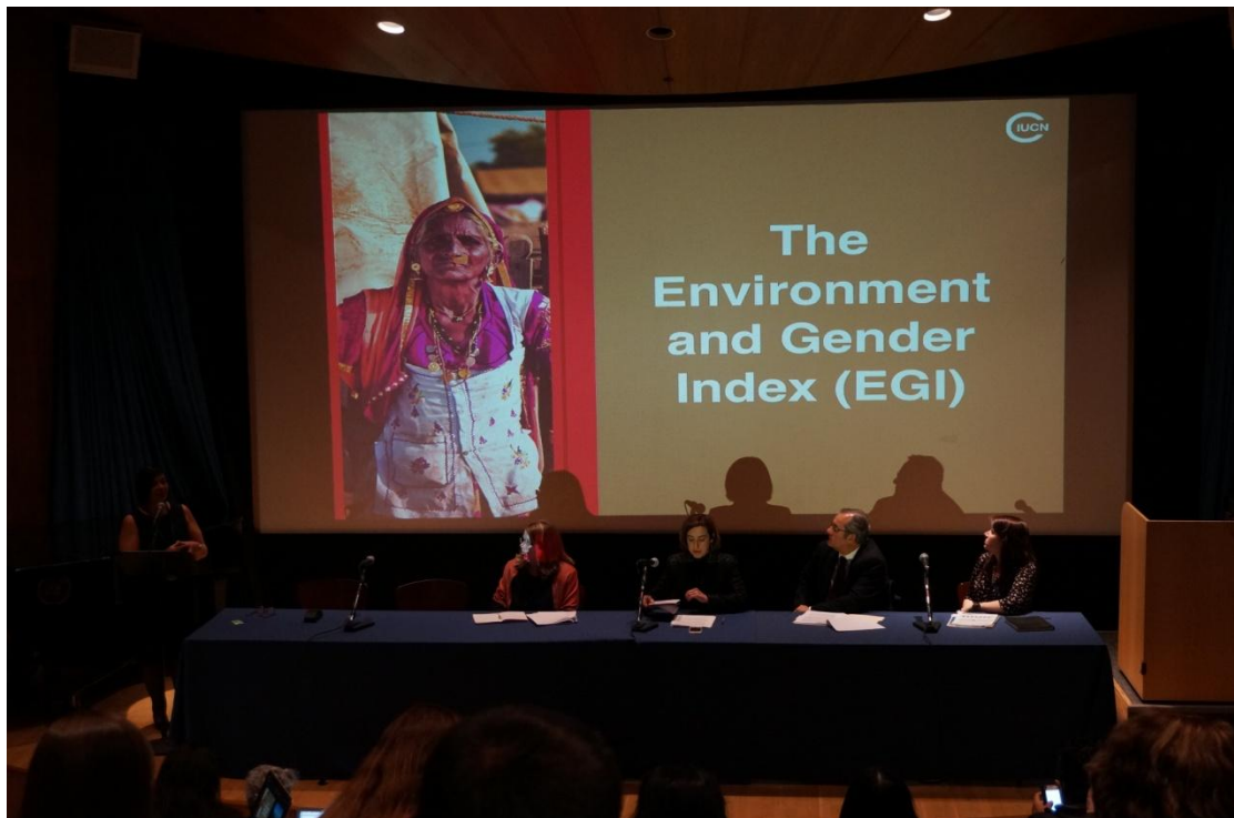
圖4：3月9日CSW周邊會議「環境性別指標：測量公平未來的達成情形」(The Environment Gender Index: Measuring Success for and Equitable Future)。