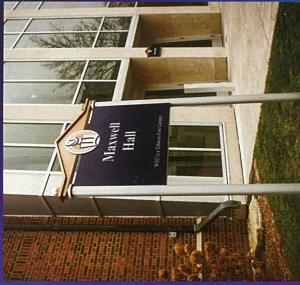
Gundersen NCPTC's main training center

Gundersen Health System 1900 South Ave. • La Crosse, WI 54601 Telephone: (608) 782-7300 or (800) 362-9567