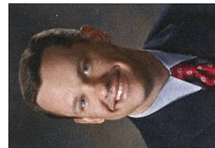
NEBRASKA Jon Bruning Presidential Appointment