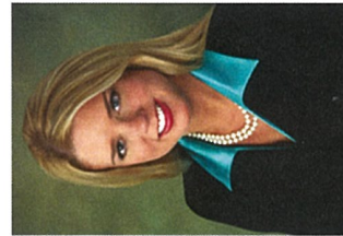
FLORIDA Pam Bondi Presidential Appointment