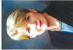
MASSACHUSETTS Martha Coakley Chair, Eastern Region