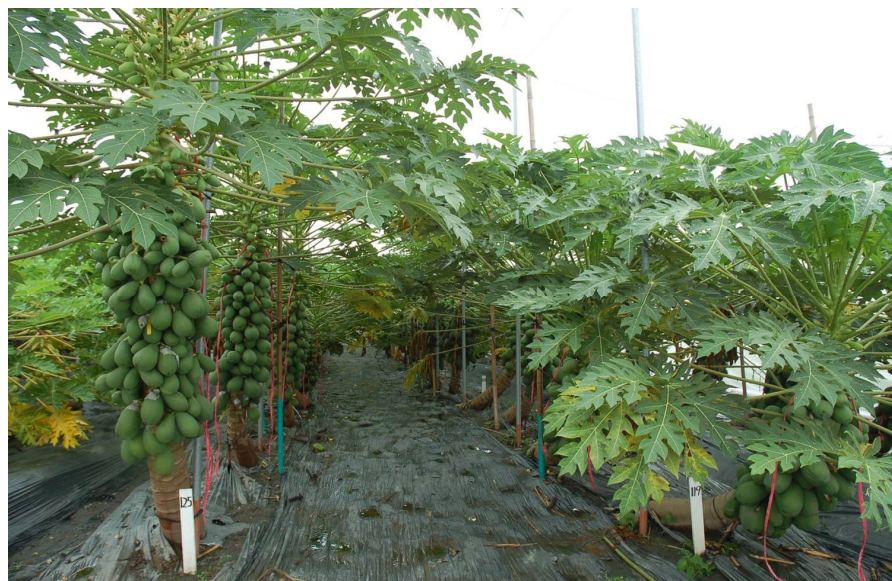
Fig 4. Papaya experimental field in KDARES