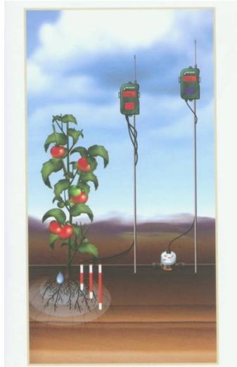
Fig. 1 Tentionmeters installed at three different soil depths – 30, 60, 90 cm.