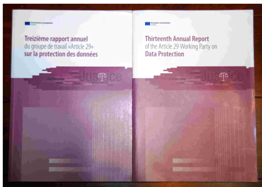
（歐盟執行委員會提供第 29 條工作小組年報資料）

歐盟並提供第 29 條工作小組第 13 次個人資料保護年報資料（英文版、法文版）供參。