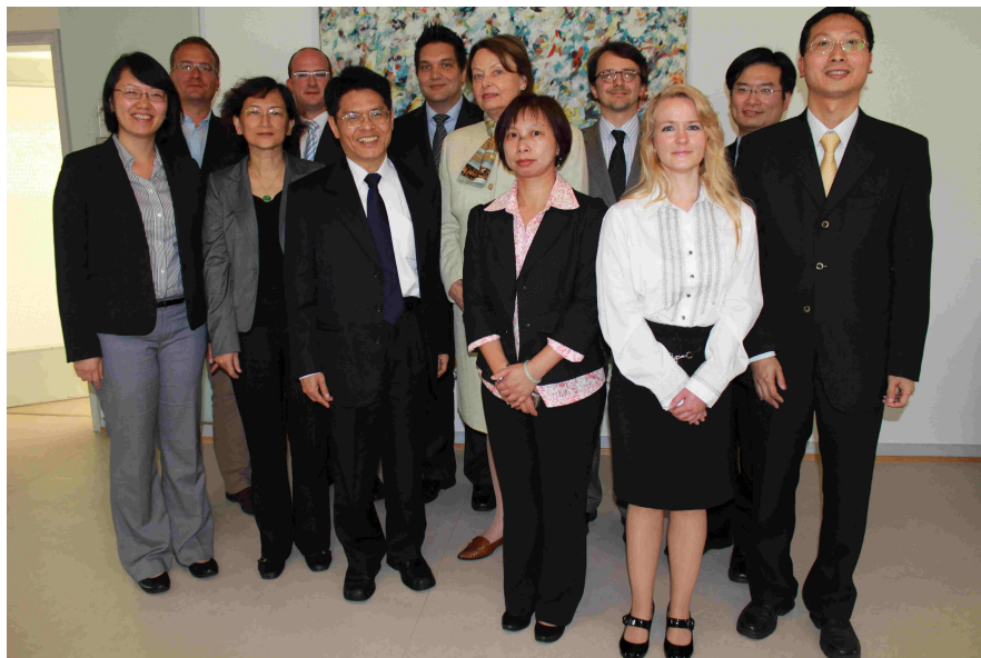
(本考察小組與德國聯邦資料保護及資訊自由委員會代表人員合影)