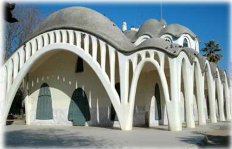
Modern style. Art nouveau