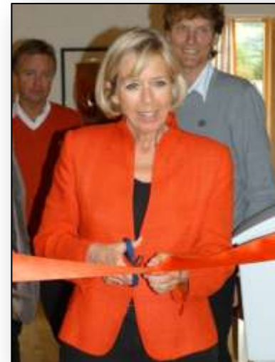
Official opening by The Norwegian Health Minister