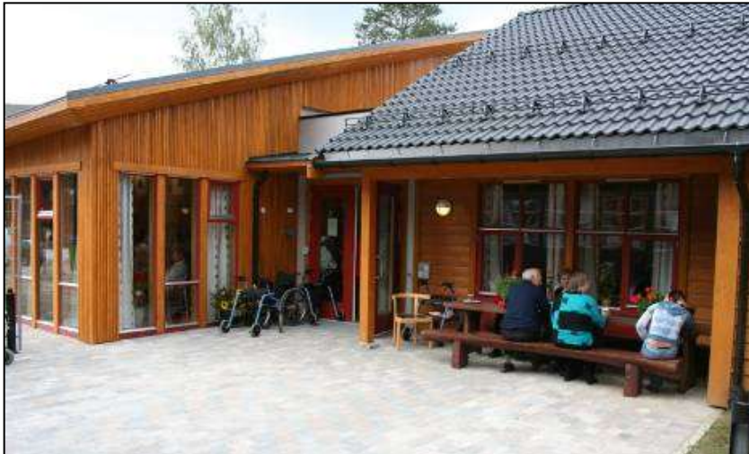
The show room is located in the centre of Vågå